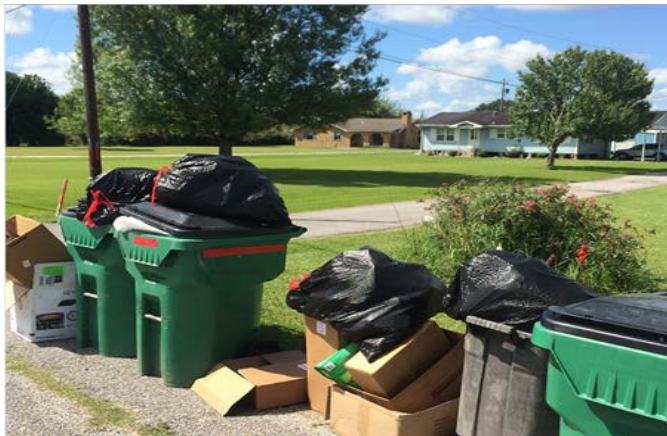
2x/Week Garbage Pickup