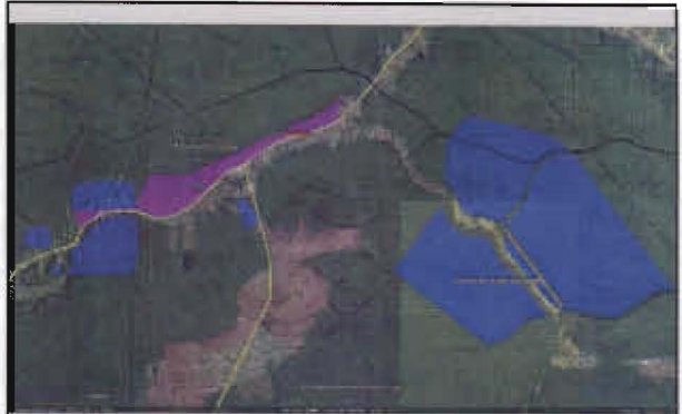
Potential Flooding Flooded Areas (December 16, 2009)